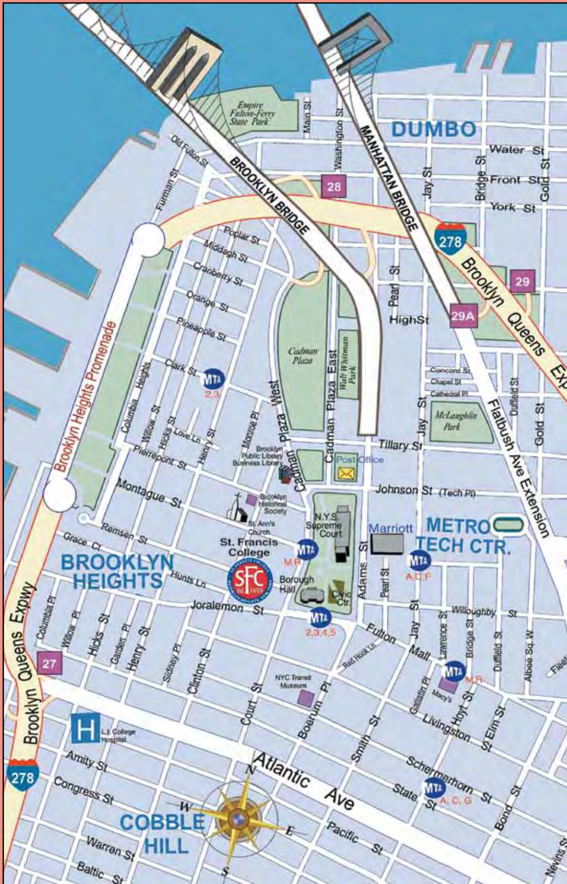
St. Francis College ■ 180 Remsen Street ■ Brooklyn Heights, NY 11201